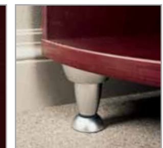
Adjustable feet are standard on all pedestal and storage components and are offered in Silver or Black Nickel